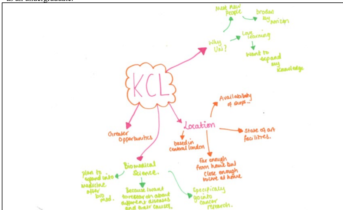
Figure 1: A female A-Level mathematics student's mind map for applying to study biomedical science as an undergraduate.

as concept counting , which would involve identifying the various concepts within a mind map and recording their frequency (Turns, Atman & Adams, 2000), appeared to be the most suitable for addressing the research questions.