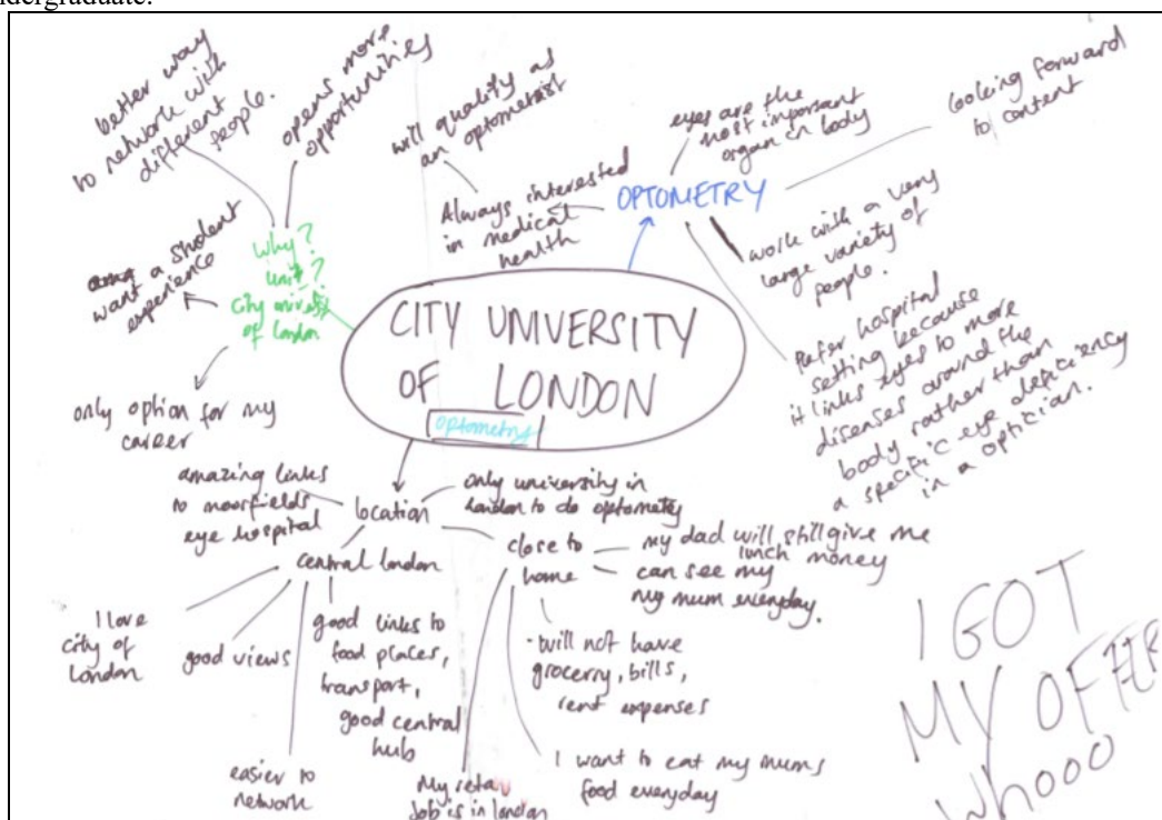
Figure 3: A female A-Level mathematics student's mind map for applying to study optometry as an undergraduate.

The findings indicated gender differences in their motivations for selecting their undergraduate courses. The joint most popular reasons given by the males for their course selections addressed their perceived earning potential, often justified by comments relating to their family circumstances such as “I want to buy my mum a house.”