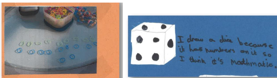
Figure 1: Extracts from children's scrapbooks