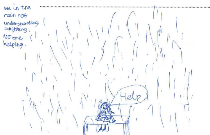
Figure 3: Taylor’s drawing of herself doing mathematics

Drawings revealed a view of mathematics as a deskbound, number and calculation-oriented subject, with 11/14 drawings showing calculation-based work carried out in the classroom. Out of the remaining three, one portrayed a child chanting times-tables in bed to help them get to sleep, the second sitting at a desk outside in the woods carrying out written calculations, and the third demonstrating calculations to the class. This final example was the only instance in which the child portrayed any kind of social interaction, despite learning in a classroom where talk partners and mathematics buddies were embedded in practice. Perhaps the most poignant illustration came from Taylor, who explained that the image in Figure 3 did not represent how she typically felt, but that this was her experience when confused: